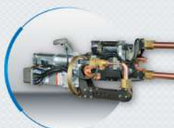
Strong Structure (SS Gun) / 強力結構型