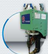
Auto-Alignment Function / 自動補正功能