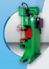
Pneumatic Stationary Type / 空壓立式

Pneumatic Stationary Type, Pneumatic Rocker Arm Type, Portable Clip, Portable Single Spot and Pneumatic Single Spot. 空壓立式、空壓吊嘴式、手提夾式、手提單點式、氣動單點式。