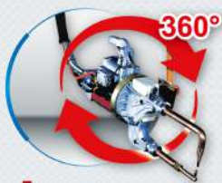
A Gun / A槍