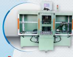
Multi-Spot Dual Jigs / 多點雙模式

Multi-spot, multi-station, servo multi-axis, auto-alignment function and for all kinds of enclosure, cabinet and case. 多點式、多工式、伺服多軸式、自動補正功能、各式箱體外殼專用機。