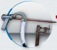
Portable Single Spot / Pneumatic Type / 手提單點 / 氣動單點式