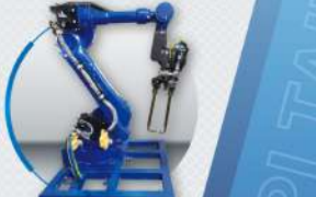
Robotic Gun / 機器人用槍