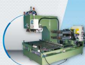
Multi-Station / 多工站