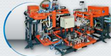
Multi-Station Multi-Jig / 多工站多模式