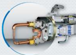
MFDC / 變頻直流