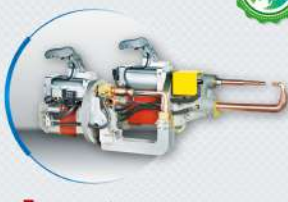
C Gun / C槍