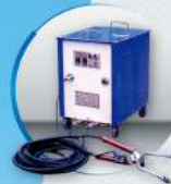
Portable Clip Type / 手提夾式