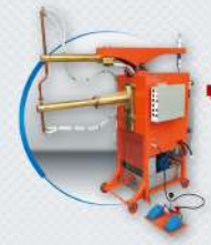
Pneumatic Rocker Arm Type / 空壓吊嘴式