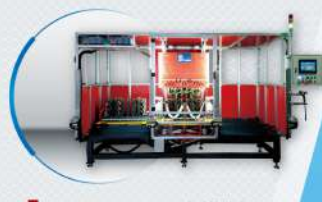
Multi-Spot Dual Jigs / 多點雙模式